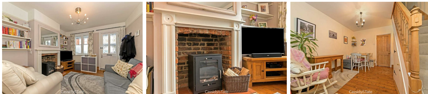
Ground Floor Approx. 348.7 sq. feet

Nestled within a cul-de-sac location in the much sought after Bernard's Heath area is this lovely Victorian two bedroom, mid terraced property which has been extended to the rear providing elegant and well proportioned living accommodation, whilst retaining some period detail. The property is arranged on two floors with entrance door into the living room, door into a separate dining room which in turn is open to the kitchen. With obtaining the relevant planning consents, there is the possibility to 'open up' the two reception rooms and create an 'open plan' downstairs (stpp). Upstairs are two bedrooms and a family sized bathroom. The property is presented in a lovely decorative order throughout. Charming features such as solid wood flooring and a feature fireplace, create a cosy feel, while a neutral decor allows for a modern twist. Outside is a low maintenance rear garden enclosed by timber boundary fencing with patio area and rear gated access. There is also a garden shed, Outside floodlight and water tap. To the front of the property is a small area with ornamental stones and a picket style fence. Upper Culver Road is conveniently located for ease of access to the city centre with its extensive shopping and leisure facilities, within the catchment of good schools and near to the mainline railway station.